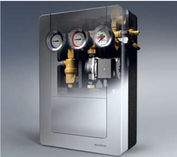
The Solar Station is included with Schüco's integrated thermal packages.

Specifications subject to change without notice.